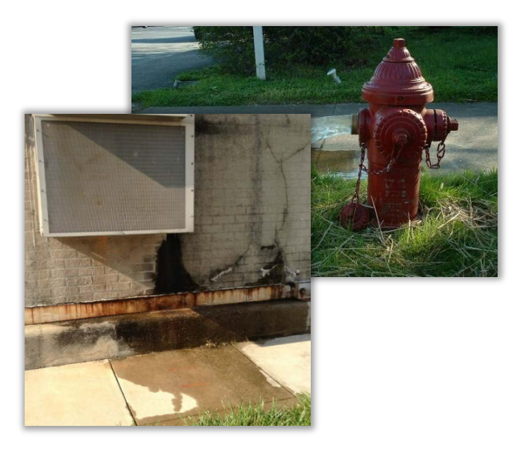
Table 2. Discharges not typically considered as illicit discharges.

There are some discharges not considered as illicit discharges unless VHCC identifies them as a significant contributor of pollutants. Allowable discharges, as listed in Table 2 , may not be easily identified as the source of a flow within the storm sewer. These flows can occur during dry weather, indicating a potential illicit discharge and resulting in an investigation to determine the source may be necessary. If the source is unknown it should be reported to the Superintendent of Buildings and Grounds. Procedures for investigating the source of an illicit discharge are further described in Section 2.5 of this Handbook.