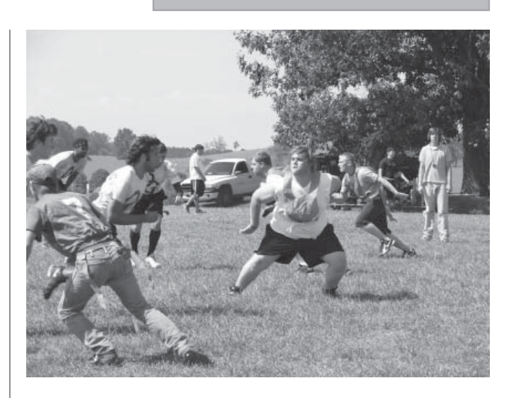
Intramural sports at VHCC, flag football and volleyball.

Additional information and forms are available on the VHCC website at www.vhcc.edu/financialaid/veterans .